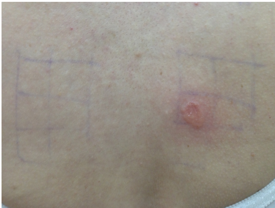
Figure 1. Photopatch testing of a 48-year-old woman

In case of all patients response to UV light was normal in MED testing. Patch tests' results with the European Standard Set of contact allergens were all negative. In all cases after 24 hours results of photopatch tests with ketoprofen were positive (erythema and papules). In cases one and two, positive reactions presen-